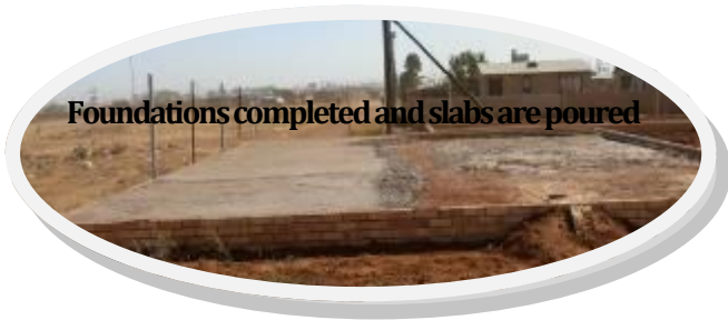
Foundations completed and slabs are poured

Building continues with the pre-school being built in partnership with CASE –International Harvester . The foundations and slabs have been completed. However nothing is ever written in concrete in Africa, so we solicit your continued Prayers until the project is finished. The original vision was to add a grade each year until it reaches 12th grade when we will have about 2,000 students. For now we are concentrating on completing the pre-school and Kindergarten classes that will accommodate about 80-100 children.